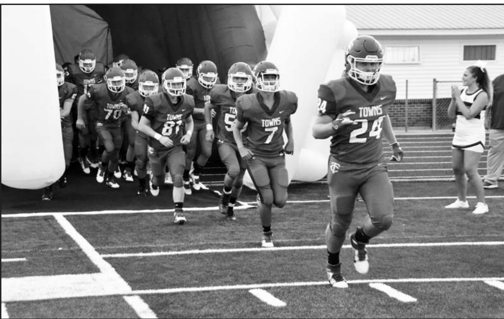
The Indians take the field at home against George Walton Academy on Sept. 20.